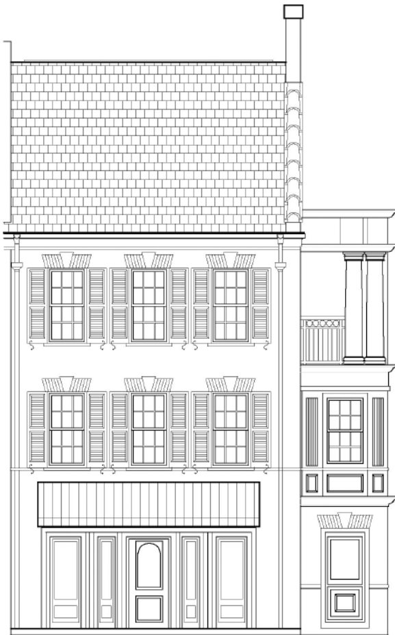
Elevation - One