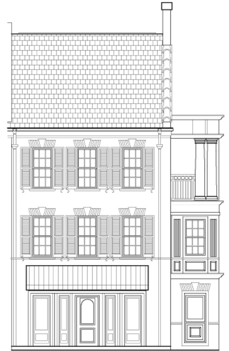
Elevation - One

3 - Bedrooms • 2.5 - Baths • Private Courtyard First Level - 845 Square Feet • Upper Levels - 1549 Square Feet 2394 - Total Square Feet